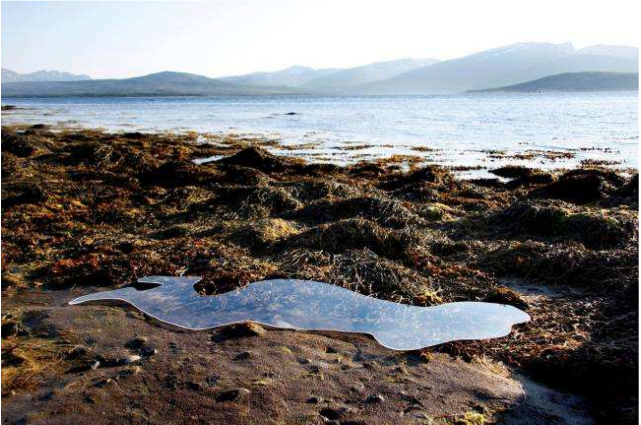
Somnambulist's Song III Lightbox, Translite Print 2009, 19" x 25"