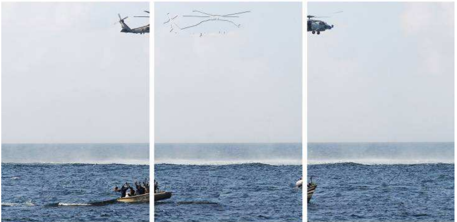
Surrender Digital Composite Print Edition 4/ 5, 2009 27 x 44 inches each (Triptych)