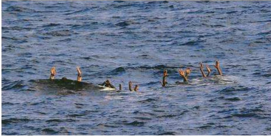
No Title Digital Composite Print Edition 4/ 5, 2009 20 x 41 inches